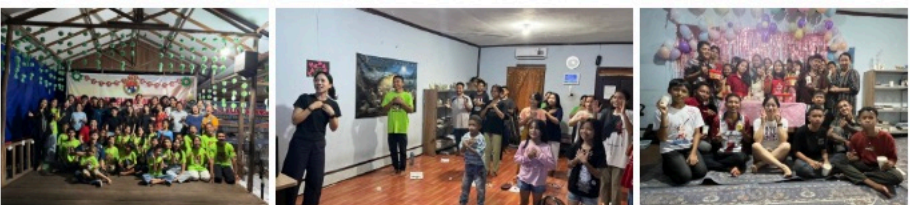
JOYFUL MOMENT WITH NHY / PRAISE IN ACTION SONG/ CELEBRATE JESUS

Within whatever time and circumstances God allows, we want to give our very best and, for as long as we are with these children, faithfully deliver all that God desires to give them. Please pray with us toward this end.