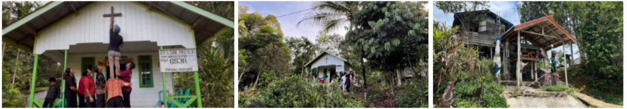
SET UP A CROSS AT THE CHURCH IN DESA DIRUNG BAKUNG / HINDU KAHARINGAN SHIRINE FOUND IN EVERY VILLAGE

From the 4th to the 14th of April, Lev Adonai began in the Buntok area and visited many churches under AG Districts 1 & 2 in Central Kalimantan, worshiping together in Easter services. From the Puruk Cahu area, we traveled by boat for over three hours to a place called Batu Makap, where we held a service at AG Batu Makap Church. True to its name — "Batu" meaning stone or rock — the village was filled with large, solid boulders, and the church built there was truly a church built upon the rock.