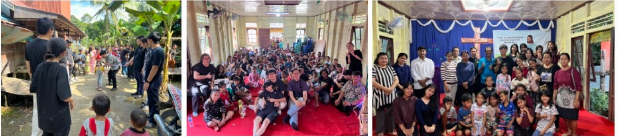
WITH CHILDREN IN DEWA MARAWAN / WITH NHY / YOUTH WORSHIP SERVICE

Through play, we felt God placing it on our hearts to pursue more intentional educational activities, build a community, and work toward establishing a Sunday school worship service in this place. Please pray with us that we may build deeper and more meaningful relationships with the parents toward this goal.