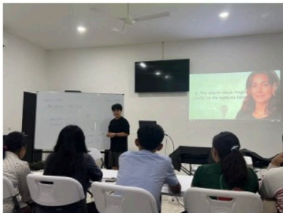
LEV ENGLISH CLASS ON EVERY MONDAY EVENING

It has already been six months since we began the Lev English classes last November. This time has been especially precious as it has allowed me to look more deeply into the lives of several