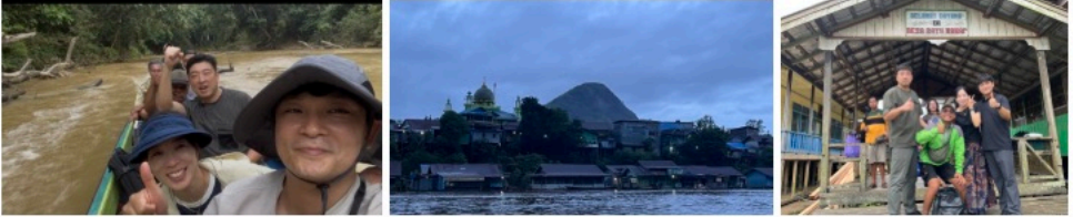
IN THE SMALL BOAT CALLED KELOTOK / ROCK MOUNTAIN WITH MOSQUE/ AT THE DOCK IN BATU MAKAP

* WE WILL SHARE MORE TESTIMONY THROUGH THE VIDEO *