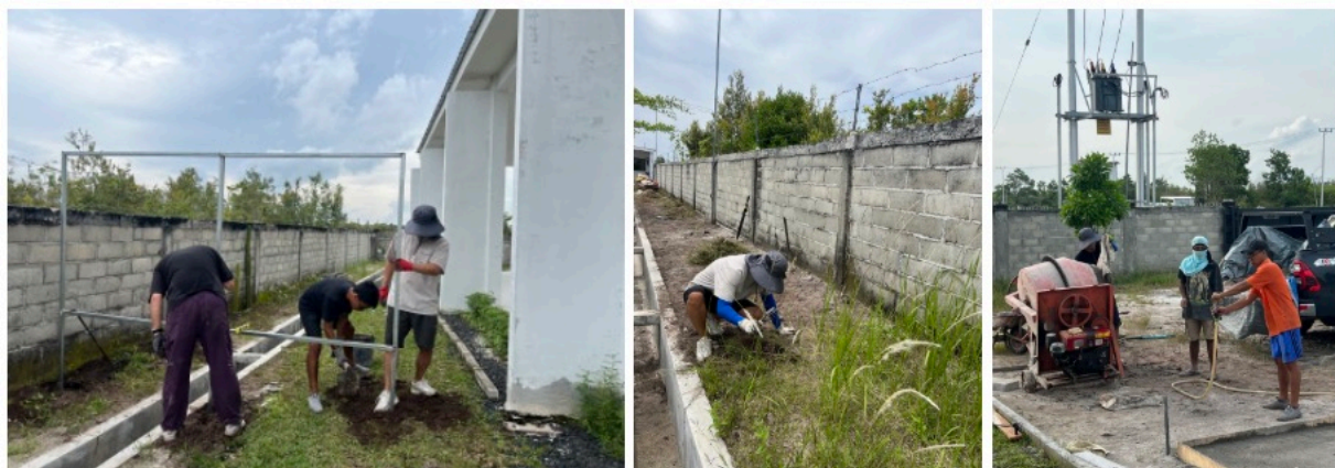
WORKING TOGETHER FOR THE MISSION CENTER

There have been many challenges along the way, but seeing the center gradually take shape fills us with immeasurable gratitude. Now that electricity has been installed, it seems that once the final paperwork is completed, we will be ready to open the café. We pray that God will open the way for all of these things in His perfect timing and in the best way possible.