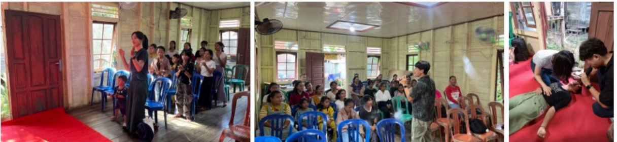
WORSHIP WITH PAHAN / SHARING GOSPEL / MINISTRY FOR POURING OUT HOLY SPRIT